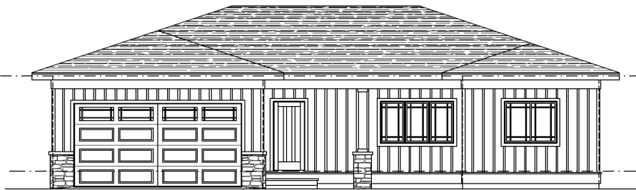
Silverbrook Estates-Plan 2 Front Elevation Study "C"