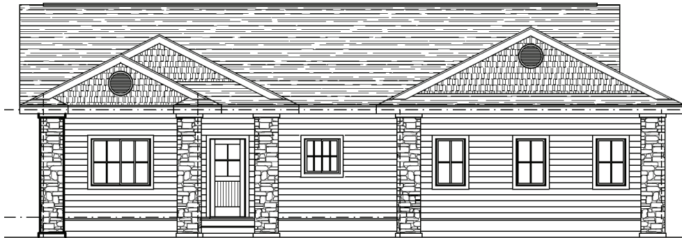
silverbrook Estates-Plan 3 Front Elevation /study "D"