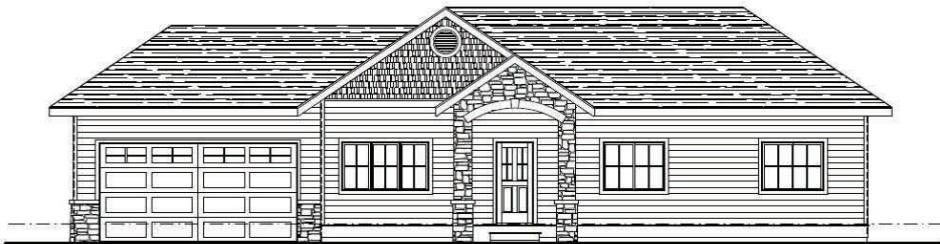
Silverbrook Estates-Plan 1 Front Elevation Study "C"