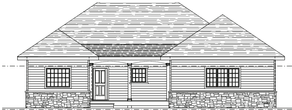
Silverbrook Estates-Plan 3 Front Elevation / study "C"