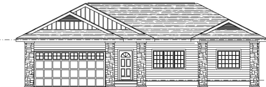
Silverbrook Estates-Plan 2 Front Elevation Study "E"