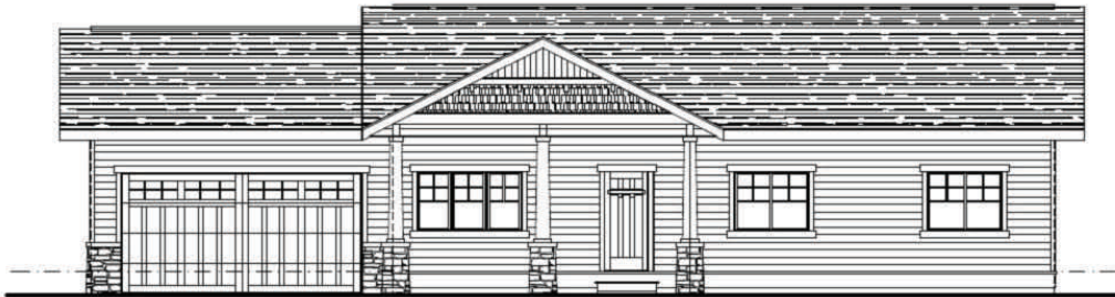
Silverbrook Estates-Plan 1 Front Elevation Study "B"