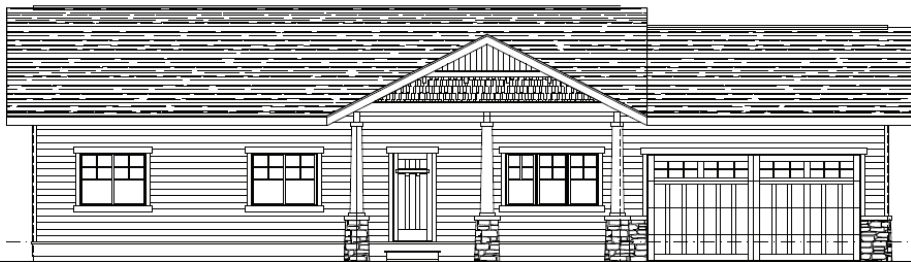
Silverbrook Estates-Plan 1 Front Elevation Study "A"